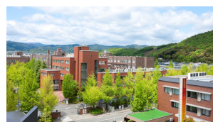
Kyoto Institute of Technology

Organizer : SIG-4DFF (Imaging Society of Japan) Co-Organizer : KYOTO Design Lab, Kyoto Institute of Technology Supporter : Soft 3D Co Creation Consortium Keio University Institute at SFC Co-Creative Consortium toward Digital-Driven Leaped Circular Society Date & Time : October 23 (Thu.) - October 24 (Fri.) Time will be determined after the program is finalized. Official Site : https://sig4dff.org/conference/2025/ Venue : Kyoto Institute of Technology 60th Anniversary Hall Matsugasaki Hashigami-cho, Sakyo-ku, Kyoto, Japan