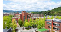
Kyoto Institute of Technology