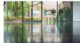
60th Anniversary Hall